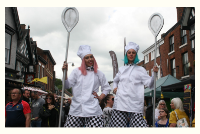
Congleton's Annual Food and Drink Festival , Town Centre, Sunday 9 June, 10.30am – 4.30pm with award-winning produce, global street food pop-ups, all-day music, magic, street entertainment and kids activities in the Town Hall. www.foodanddrinkfestival.net