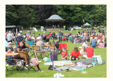
100<sup>th</sup> Anniversary of the Congleton War Memorial Hospital Picnic in Congleton Park. Bank Holiday Monday, 27 May from 12 noon – 5pm. Free entry. Music, food, drink, stalls, games, crafts and more. www. congleton-tc.gov.uk

WITH SO MANY FABULOUS EVENTS taking place this summer, Congleton is the place to be! The recent Events and Attractions booklet 2024, written by the Town Council and delivered to all households in CW12 highlighted 32 events and 19 attractions for you to enjoy. If you don't have your booklet, more are available in the information centre and the library. Three of the biggest upcoming events are: