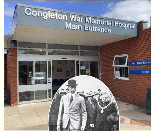
Duke of York at opening

The hospital remains an essential part of Congleton. East Cheshire NHS Trust is keen to promote the past, present and future use of the hospital and is encouraging local people to send their memories of the hospital to: ecntstaff.comms@nhs.net to create an online portal. Congleton Town Council is investigating hosting a 1920s style event in the park on 27 May to celebrate.