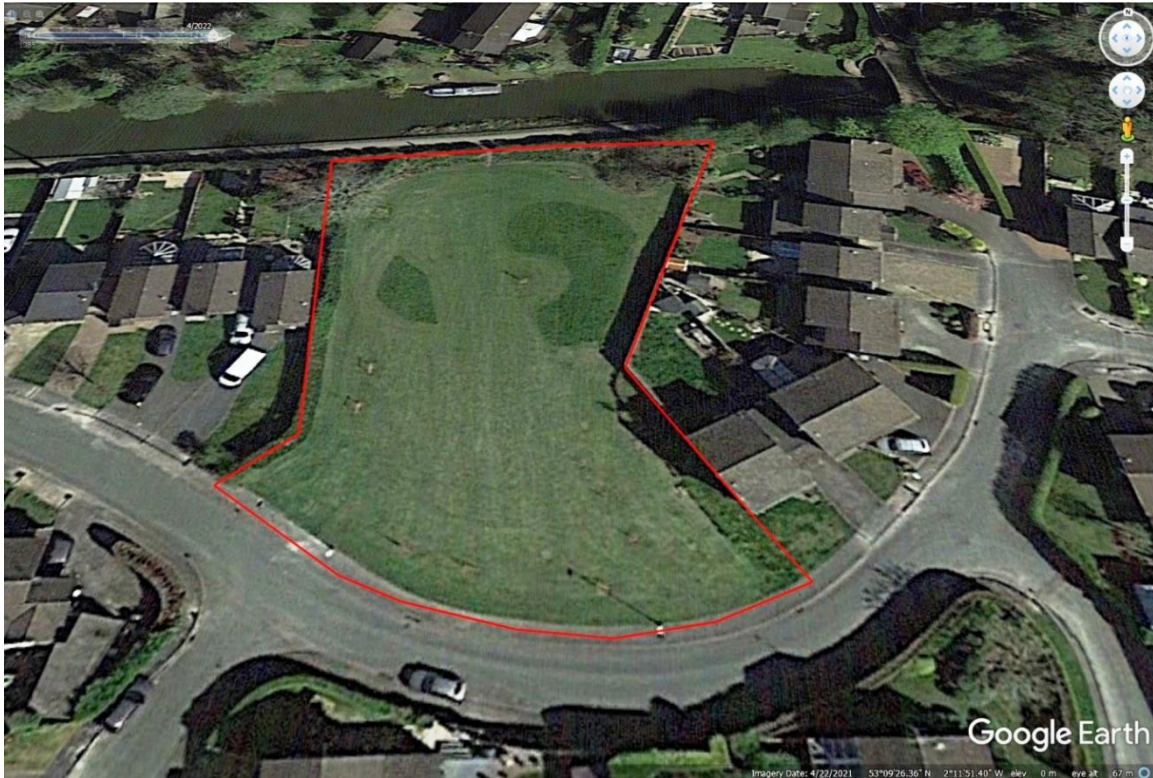
Derwent Drive green space, tilted aerial photo 2021 looking north