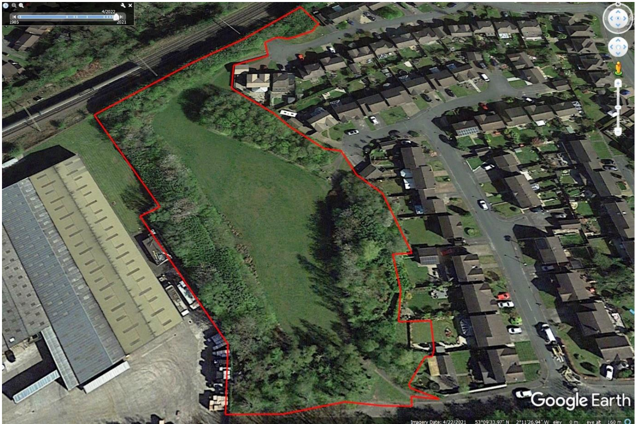
Bridgewater Close green space, tilted aerial view 2021