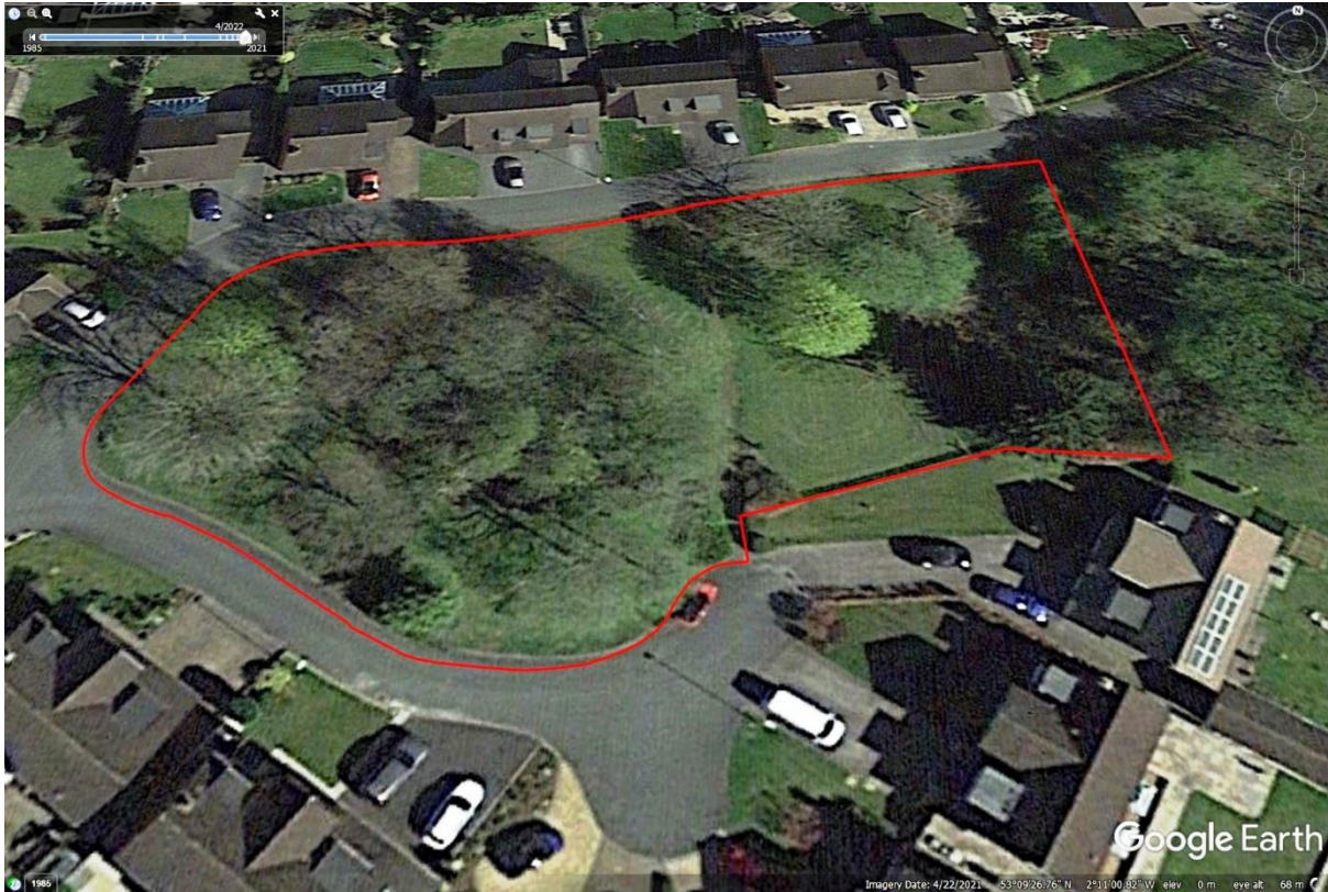
Blackshaw Close green space, tilted aerial view 2021