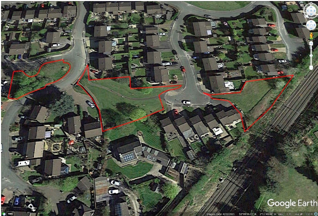
Isis Close-Tamar Close, tilted aerial photo 2021