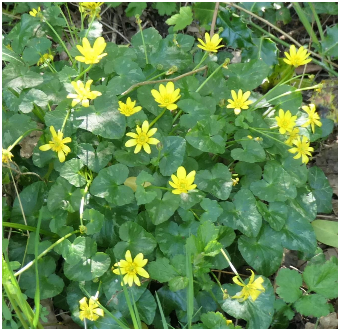
Lesser Celandine, Blackshaw Close, Mossley