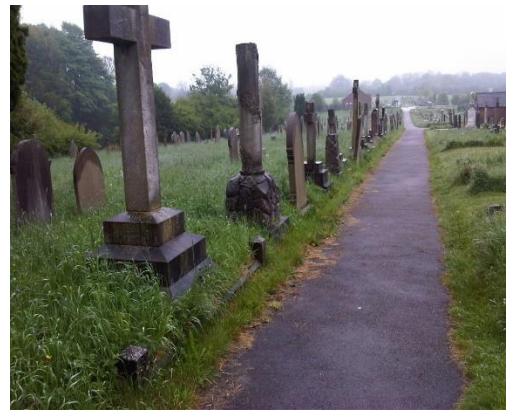
Grave Yard Section