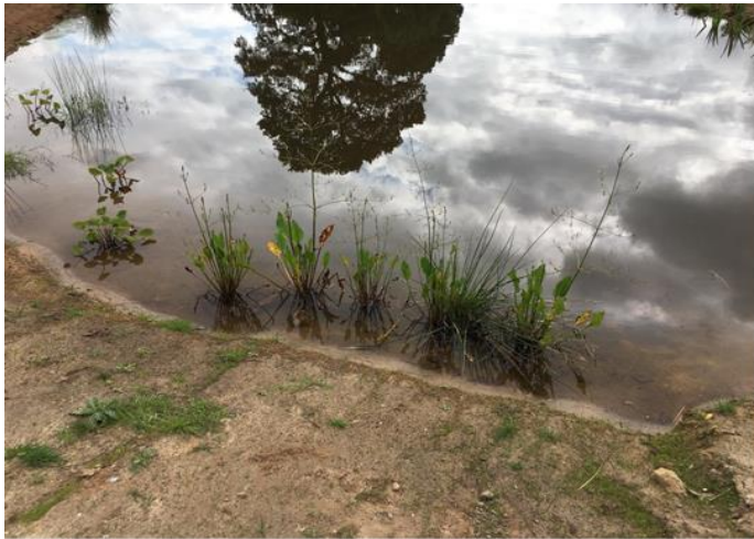
New ecology pond created by GRAHAM with new planting. Breeding Great Crested Newt larvae in first season.

Ponds created as part of our construction of the Congleton Link Road have become a haven for Great Crested Newts. Great Crested Newts have hatched in new ponds created by the company during the start of the construction work. There is also evidence of larvae alive in the ponds. The animals and their eggs, breeding sites and resting places are protected by law and can grow up to 17cm and generally live between 6 to 15 years.