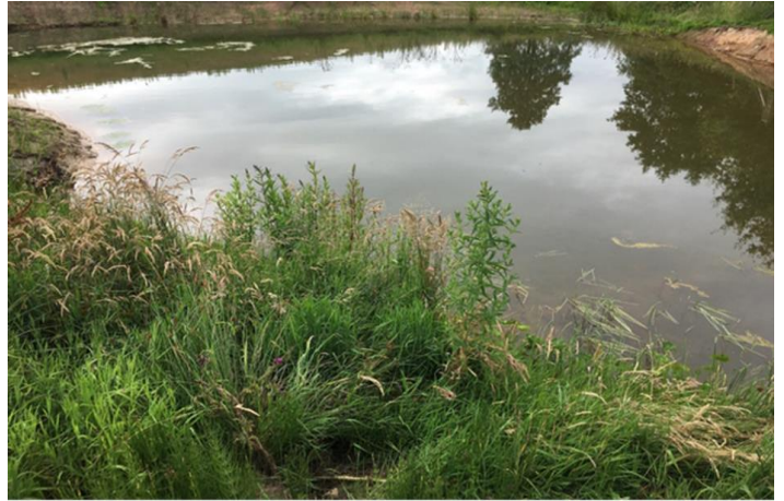
One of 6 new mitigation ponds containing great crested newt larvae in the first breeding season