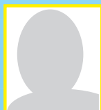
To be filled following elections in May 2019