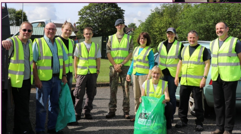
Congleton In Bloom Spring Clean