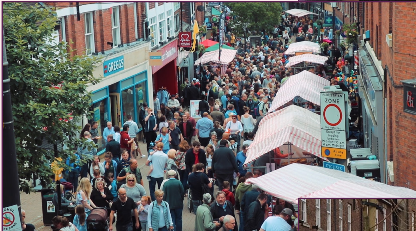
Congleton Food & Drink Festival