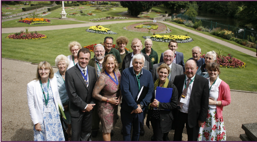
Congleton In Bloom - North West in Bloom Judging Day