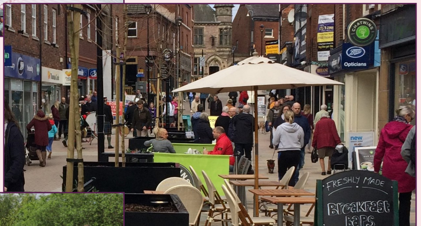
Congleton Town Centre Public Realm Works