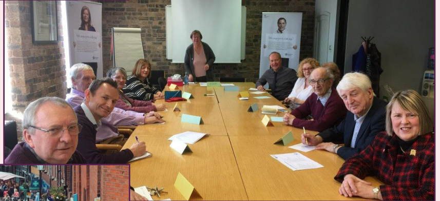
Dementia Friends Awareness Session