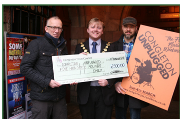
Congleton Unplugged Festival