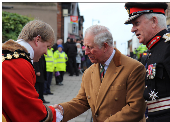
Mayor Cllr Charles Booth meeting HRH The Prince of Wales