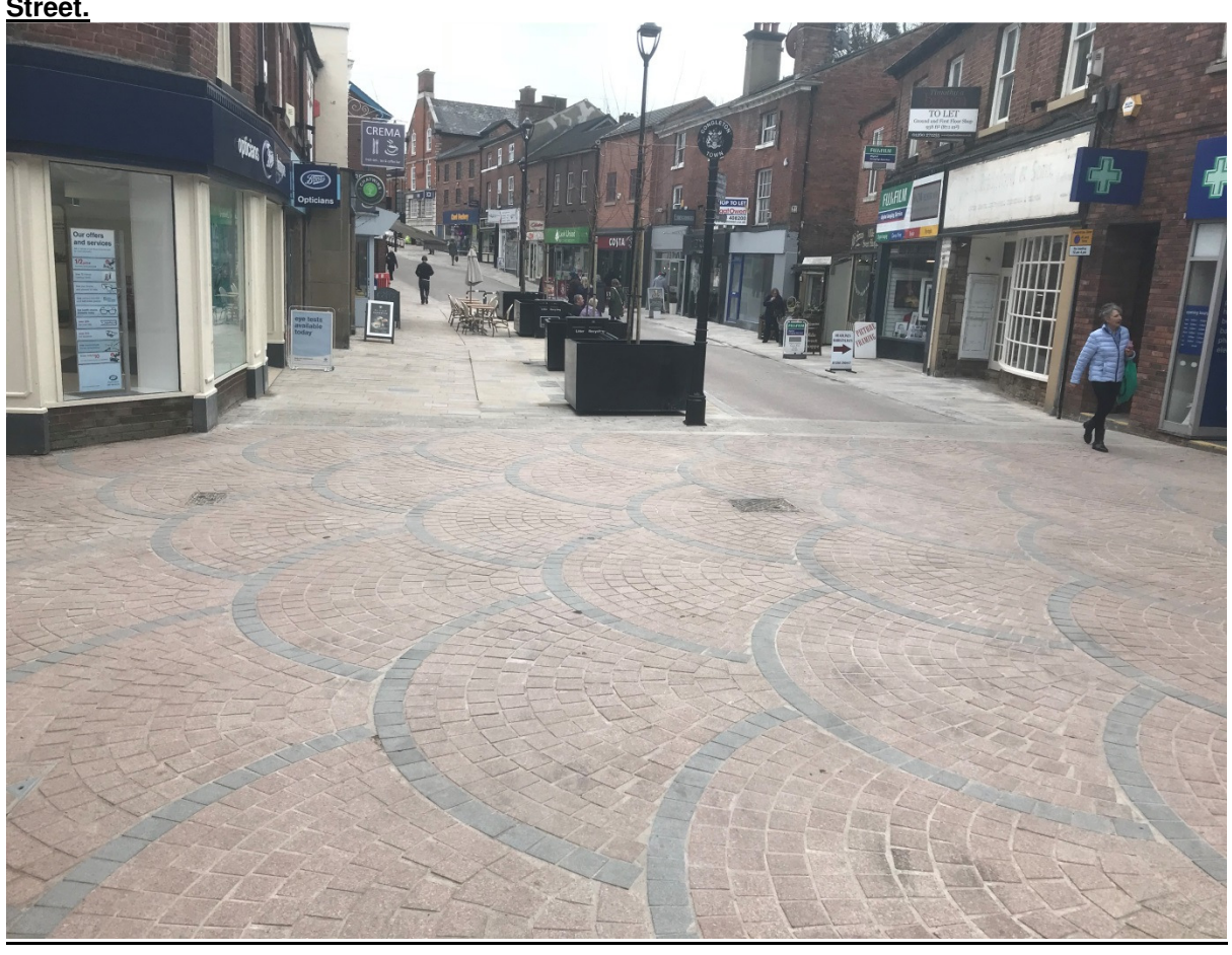
Photo number 6 shows the controlled crossing point on Market Street.

<u>Photo number 5 shows the newly installed and grouted 'fan' pattern granite paving at Victoria Street.</u>