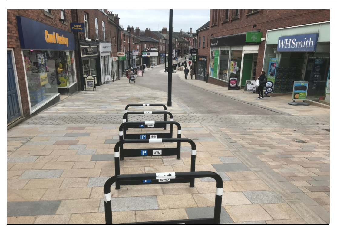
Photo number 1 shows the newly installed and grouted granite paving at Bridge Street.

Laying of the new granite paving on the south footway of Bridge Street between Costa Coffee and the Card Factory.