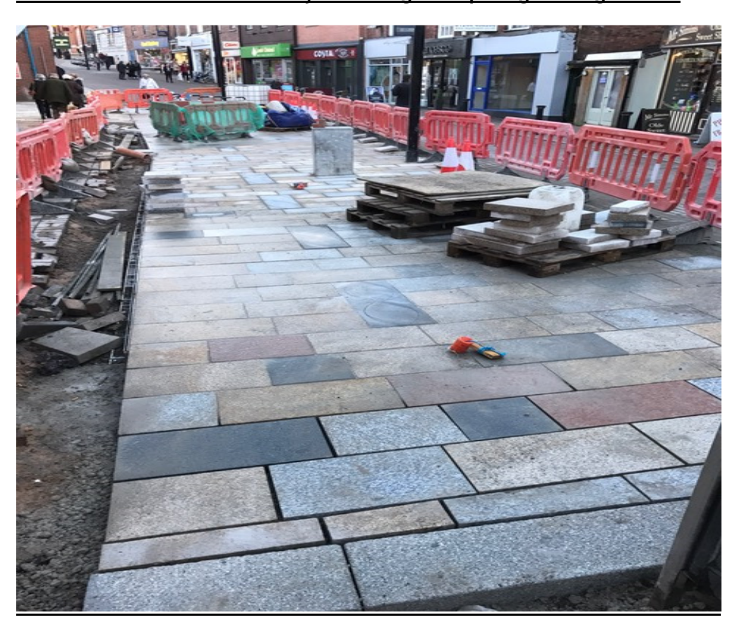
Photo number 1 shows the newly installed granite paving at Bridge Street.

Excavation of the north footway from the new slot drain to the property bounderies (from Crema Deli through to TUI).