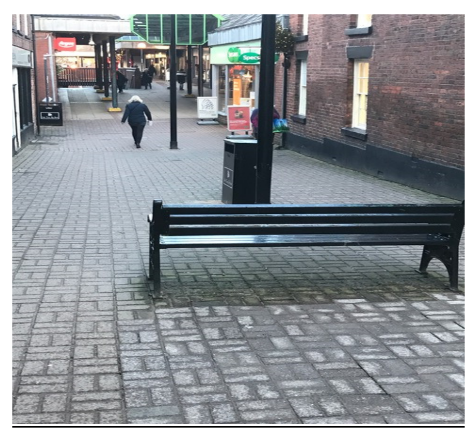
Photo number 1 shows the newly installed bench and bins on Victoria Street.

Installation of the new timber seating for the granite bench is completed. Victoria Street bench now installed. Victoria Street bins now installed. Grouting for new granite block paving is completed.