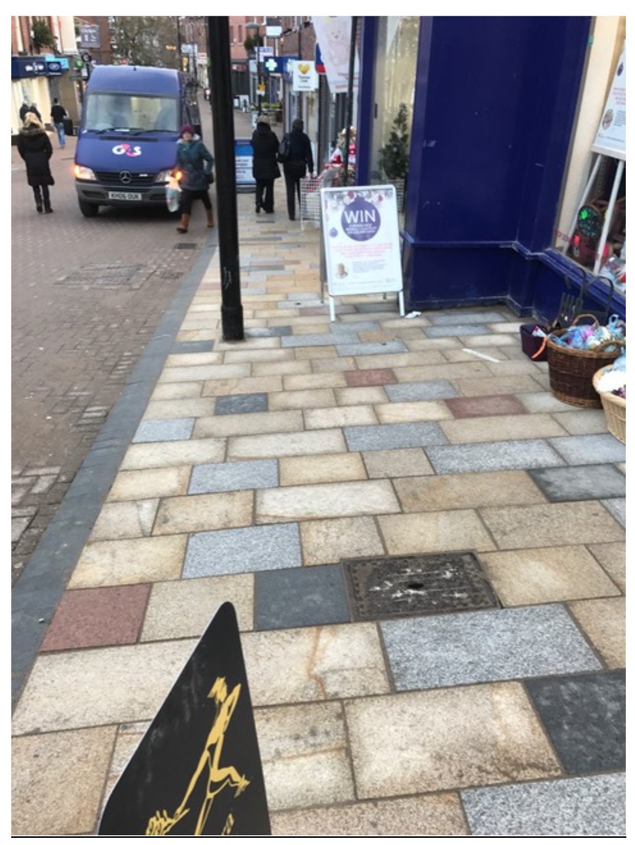
Photo number 2 shows the freshly grouted granite paving on the south footway