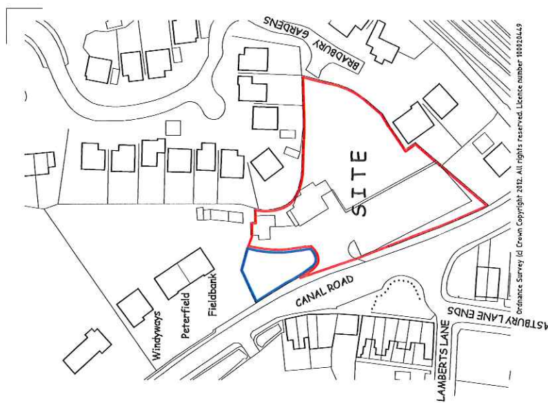
LOCATION PLAN 1/1250