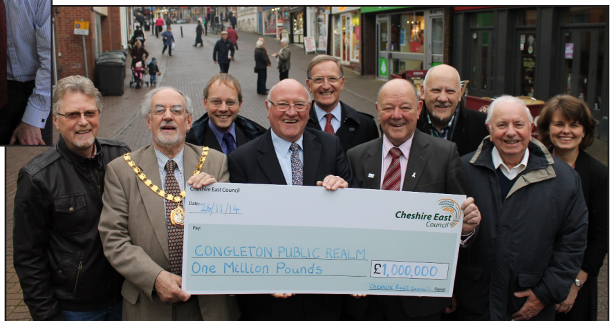
Congleton Public Realm - Cheque for £1 million