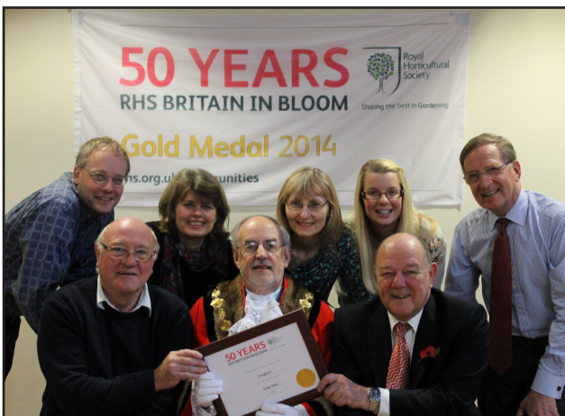
In Bloom Winners 2014