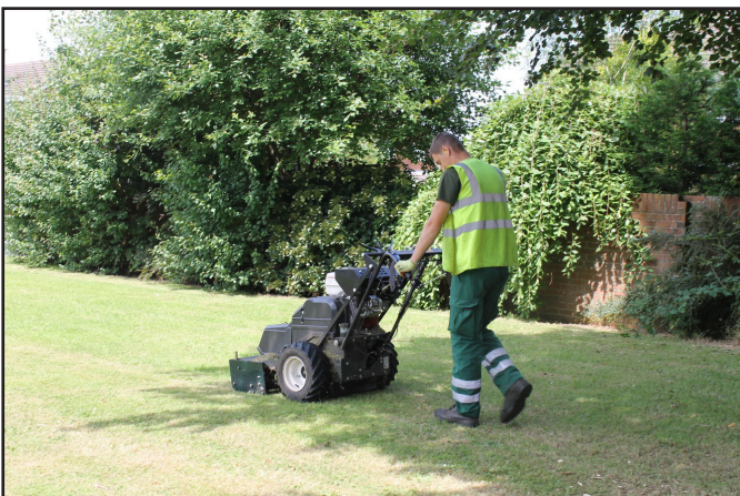
“Streetscape in Action”