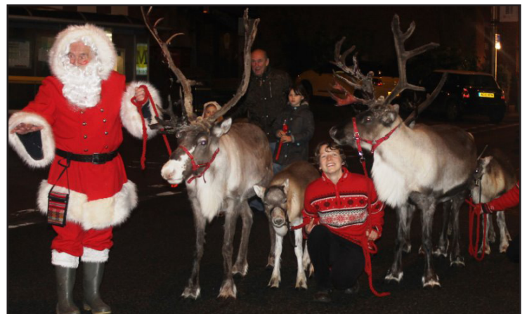
Reindeers at the Christmas Light Switch On