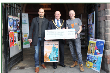
Congleton Unplugged Festival