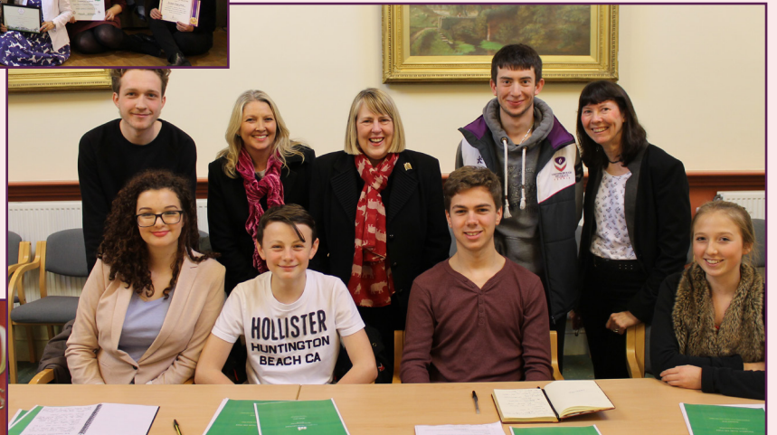
Congleton Youth Council