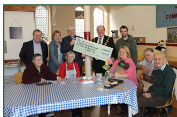
Congleton United Reformed Church