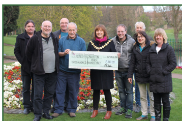
Friends of Congleton Park