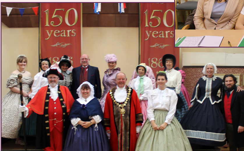
Celebrating 150 Years of Congleton Town Hall