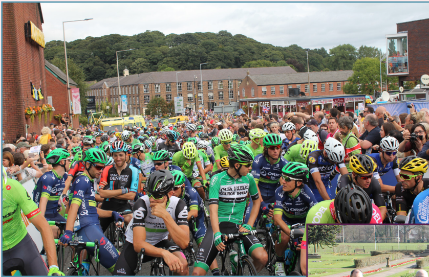
Cyclists on the start line at the Tour of Britain Cycle Race