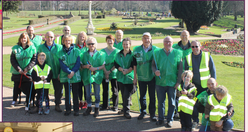
Congleton's Big Spring Clean Volunteers