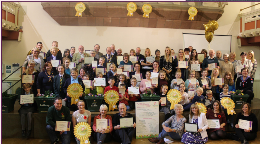
Congleton In Bloom Celebration Evening