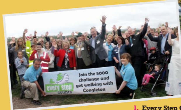
1. Every Step Counts - people completed millions of steps for Congleton