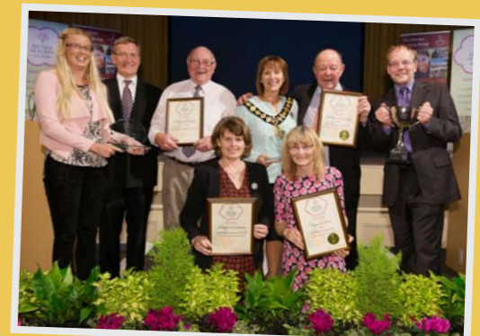
4. Congleton won the North West in Bloom competition