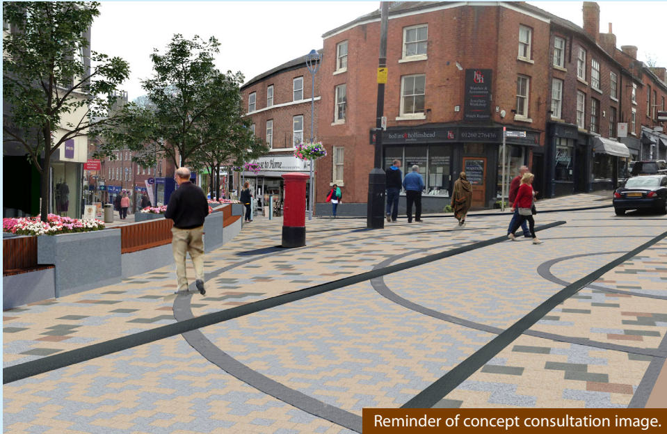
Reminder of concept consultation image.

With News from Congleton Town Council & Community Groups Summer 2017