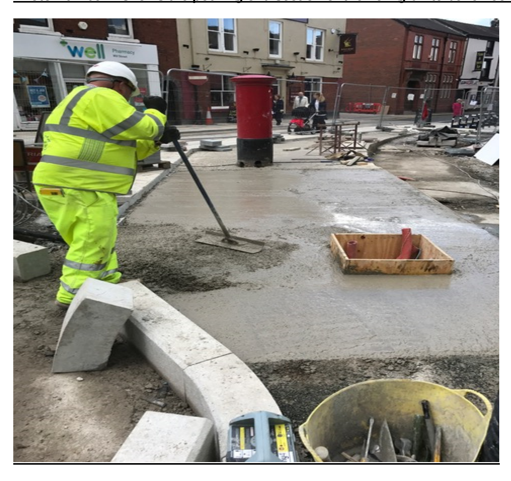
Photo Number 1 shows the pouring of a section of the new granite bench concrete foundation.

Pour the concrete foundation for the south east footway.