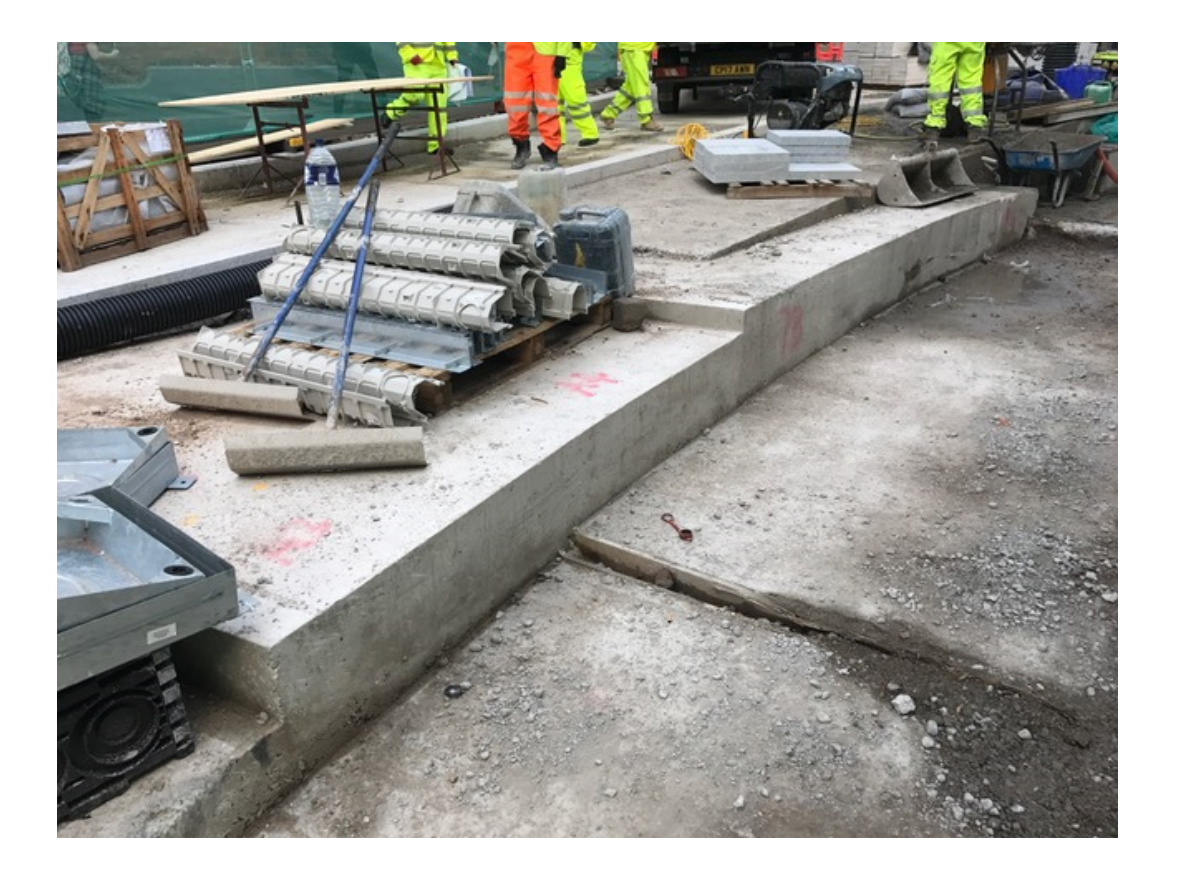
Photo number 3 shows the newly laid section of the north east footway paving.