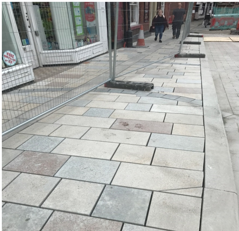
Photo Number 1 shows the new footway granite paving at Swan Bank.

Swan Bank was be reopened to traffic on Monday 11 September, as programmed.