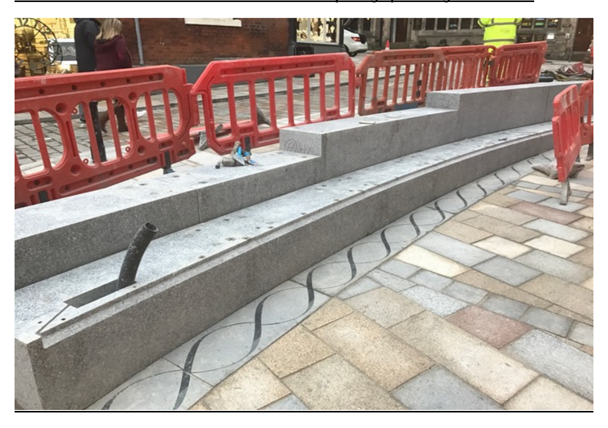
Photo Number 1 shows the installation of the new paving up to the granite bench.

Completed the installation of the granite paving up to the new granite bench.