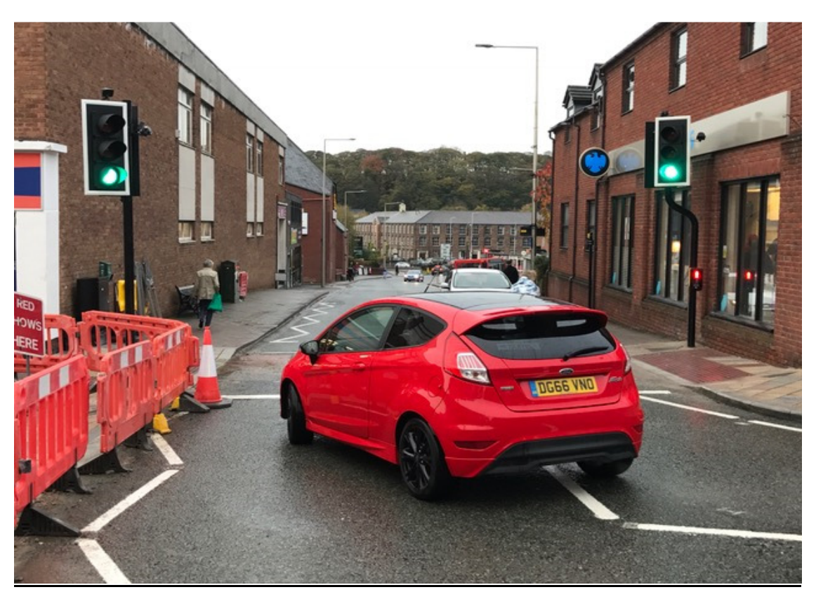
Photo Number 1 shows the upgraded controlled crossing at Market Street operational.

New controlled crossing at Market Street upgraded and operational.