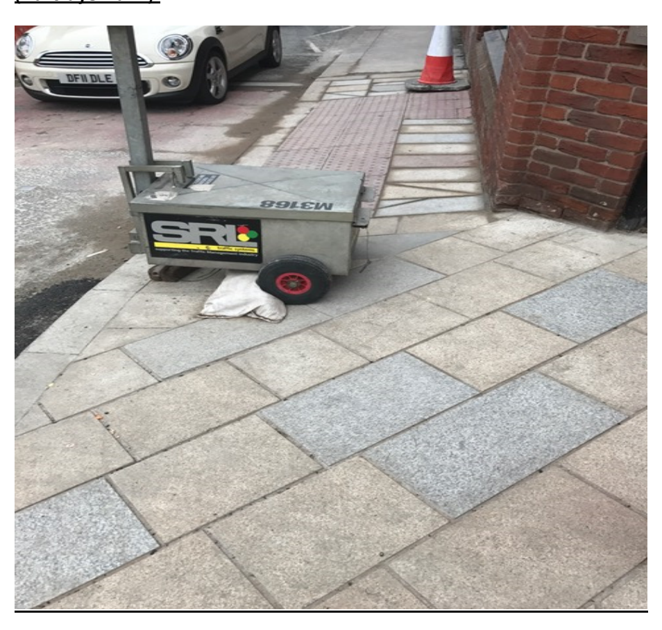
Photo Number 1 shows the new granite kerbline and paving at the north east footway (Barclays Bank).

Installation of the new granite kerbline and paving at the north east footway (Barclays Bank). Preparation works for the new upgraded controlled crossing completed. New granite kerb channels installed in the carriageway at Market Street and High Street. Commenced excavation works at the north west footway (B&M). Continued the construction of the new wall at the south west footway (Woolies Wall).