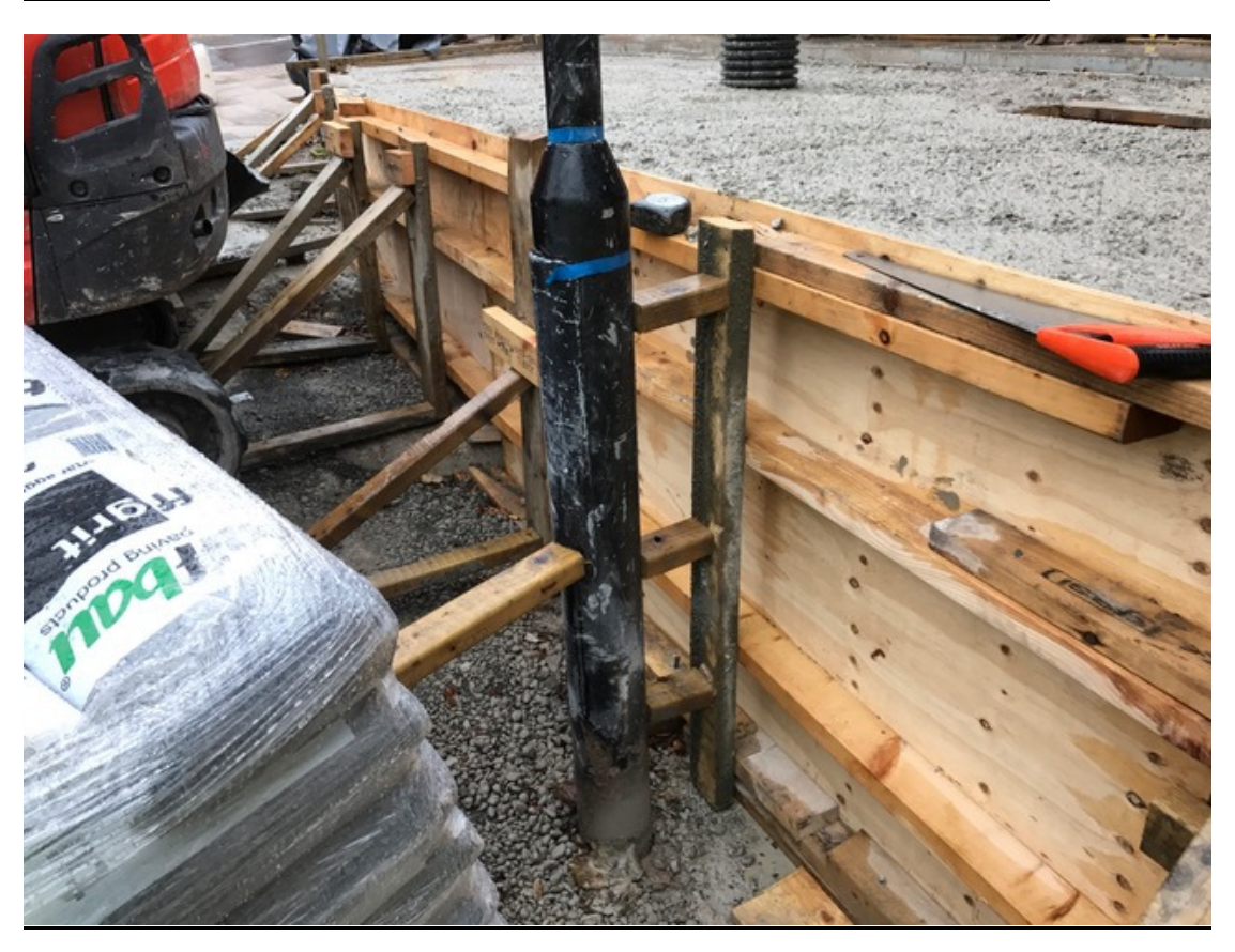
Photo Number 1 shows the formwork for the concrete pour at Woolies Wall.

Installation of granite kerbs and paving at south west footway (Woolies Wall) Installation of bollards and cycle stands at south west footway. York stone paving lifted and relayed (outside of RBS). Installation of linear drainage channel at south west footway. Concrete formwork installed and concrete pour completed at Woolies Wall.