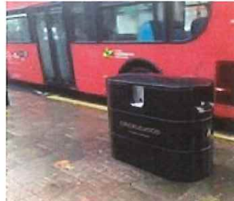
£364.00 Chatsworth Dual Bin