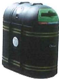
£415.25 Olympic Dual Bin

This one is preferred Agreed for RB to order for the park.