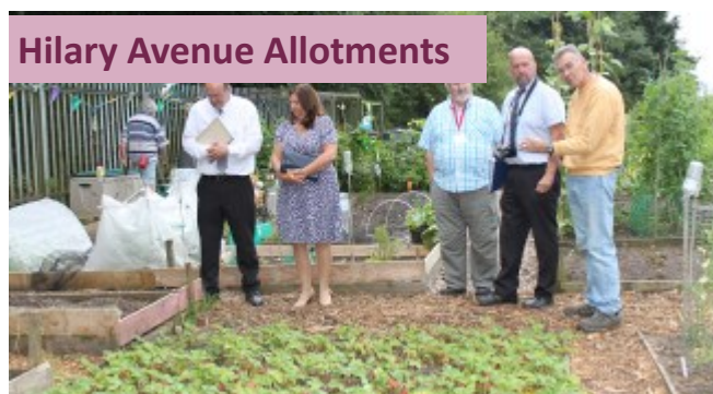
Hilary Avenue Allotments