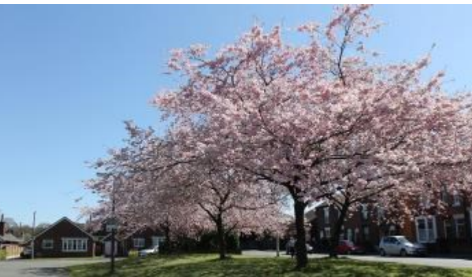
One of many Cherry Blossoms in Congleton