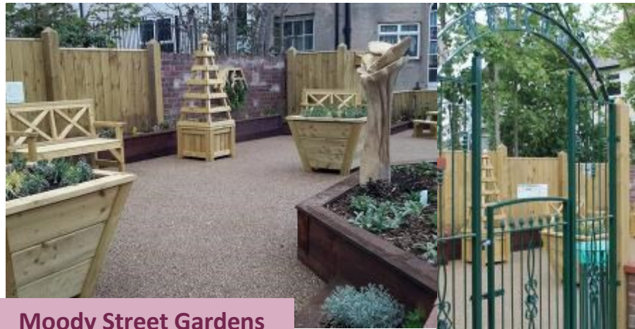
Moody Street Gardens