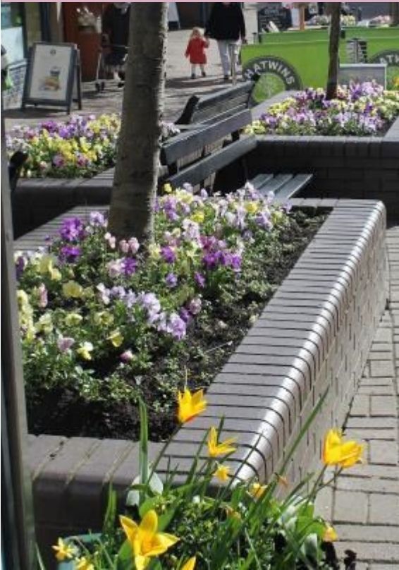
Town Centre Beds– Spring to life