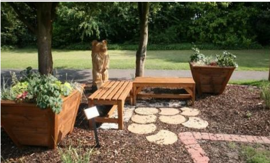
Tom Jackson Memorial Garden