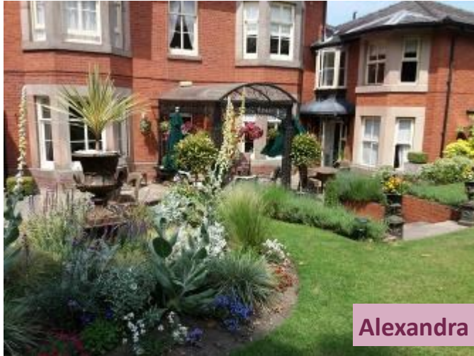
Alexandra Court Hotel

The businesses are: Alexandra Court Hotel, Astbury Mere Care Home and The Queens Head Public House. All were awarded Gold Standard last year and have been inspired to maintain and improve their In Bloom credentials.