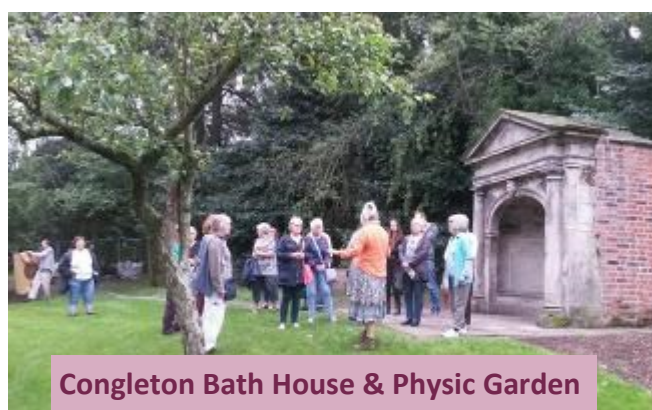
Congleton Bath House & Physic Garden