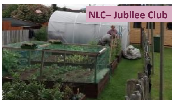
NLC- Jubilee Club