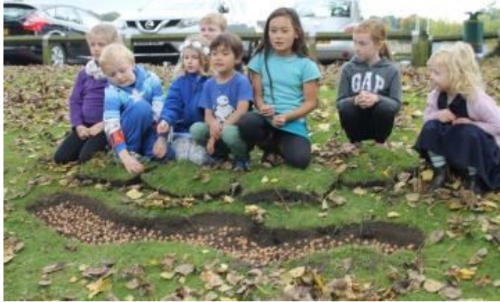
Planting up Crocus Bulbs– Purple4Polio