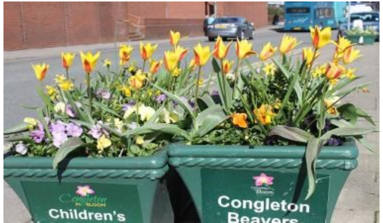
Town Centre Children's Tubs