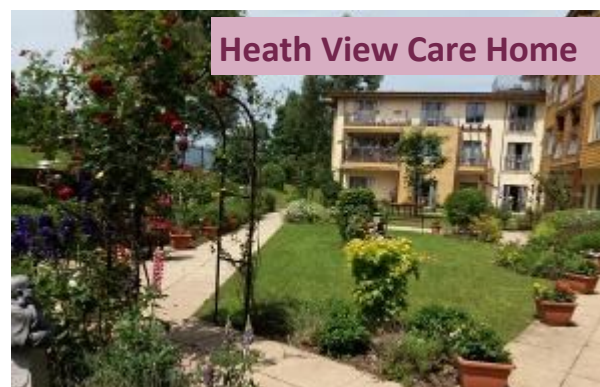
Heath View Care Home