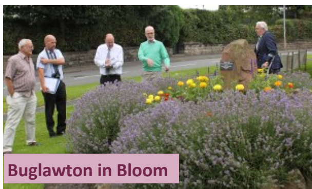
Buglawton in Bloom

There are eight It's Your Neighbourhoods taking part this year; Congleton In Bloom's sister group- Buglawton in Bloom began in 2003 and has been part of the In Bloom judging for the past 14 years. Bromley Farm Community Centre set up in 2012 and continues to improve each year. Our NWIB Judges have encouraged other Neighbourhoods to join in, such as Congleton Bath House & Physic Garden, Heath View Care Home, Hilary Avenue Allotments, New Life Church- Jubilee Club. New in 2016 and continuing to enter is Astbury Mere Country Park Trust and new for 2017 is Congleton Park via Friends of Congleton Park.