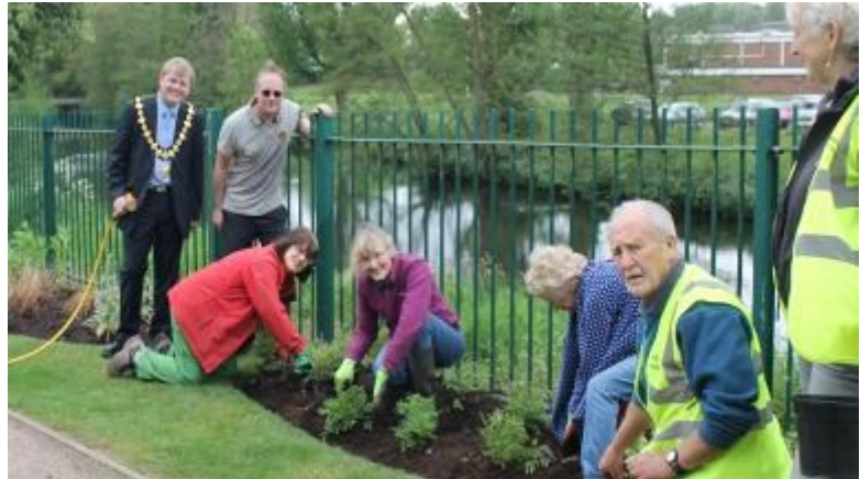
Adding Sustainable Beds in the Park