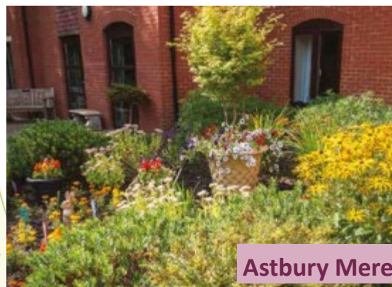
Astbury Mere Care Home