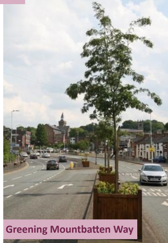
Greening Mountbatten Way