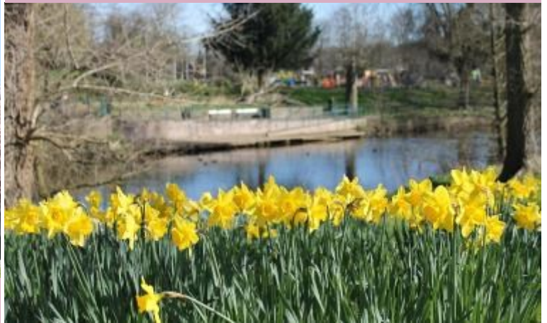
Congleton Park– Daffodils

Cheshire East planted daffodils in the verges of the town in 2015. Children from a local primary school have planted additional daffodil bulbs near Tesco roundabout. In addition to this there are more daffodils planted at most of the Congleton Town entrance signs and verges and crocuses planted on the banks along Mountbatten Way.