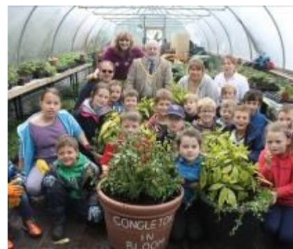
School Children plant town tubs

Favourite Front Gardens —The public have been encouraged to nominate their favourite front gardens. Publicity is given to those entering resulting in greater competition in some areas of town!