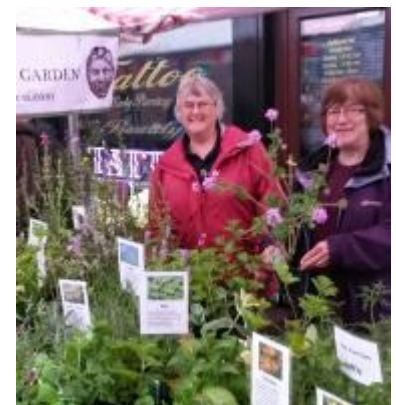
In Bloom at Food and