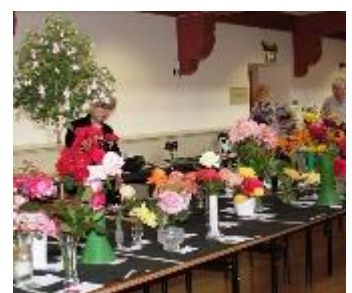
Horticultural Show— Town Hall Sept 2014