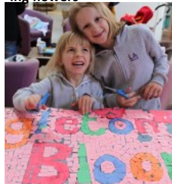
Community Workshops June 2015