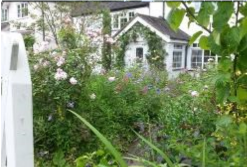
Highly Commended - Cross Lane