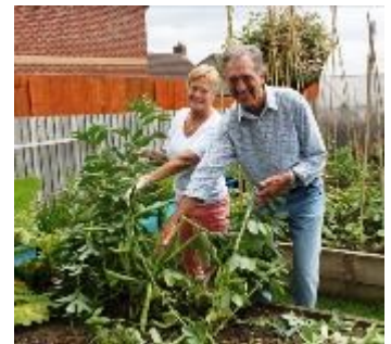
Getting to grips with allotments