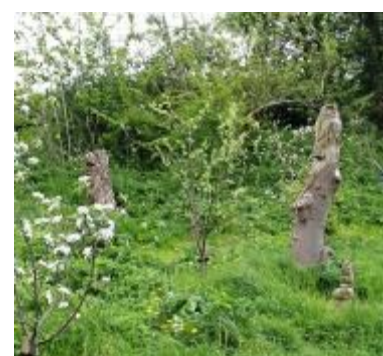
Community Orchard in Bloom