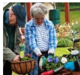
Planting up baskets