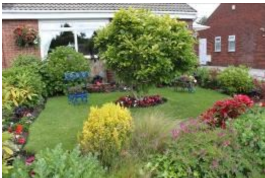
Highly Commended Lower Heath