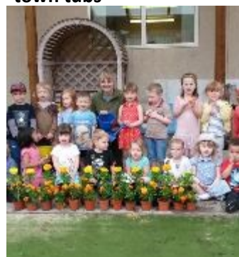
Pre-school children growing flowers