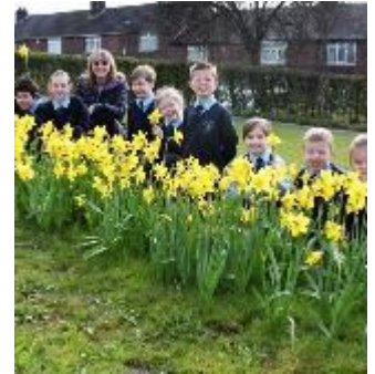
Children admire 'their' daffodils

July : Deadheading, weeding, watering, litter picking. Enjoying the Green spaces and North West in Bloom judging Taking tremendous trees, bears and tubs to RHS Tatton. LOL ex-soldiers also displaying a 'defiant trench allotment' which has been grown in the polytunnels and will be displayed in Congleton after the RHS Show (21-24 July)