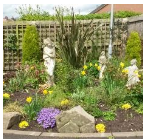
Spring Planting—Heath View