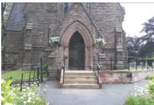
CHURCH—Mossley Holy Trinity