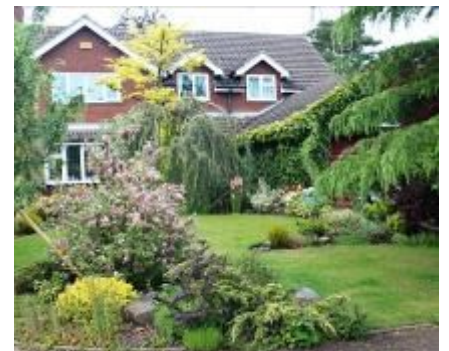
Highly Commended Cedar Court