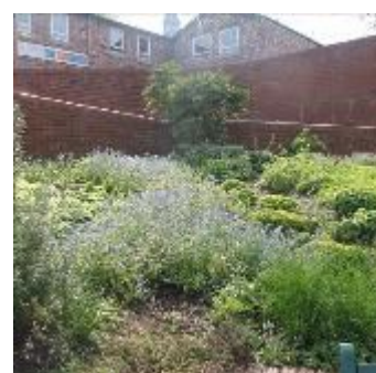
Capitol Walk bed—all year around colour