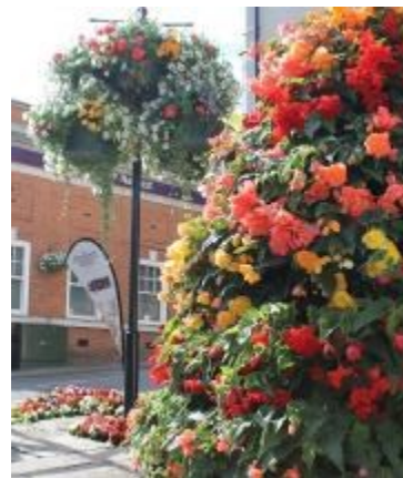
Town Centre Flower— pedestrian area

The Town Council works closely with the local Four Oaks nursery and Cheshire East's Ansa section. Plants are grown at the nursery and delivered to the Town Council poly tunnels for planting out.