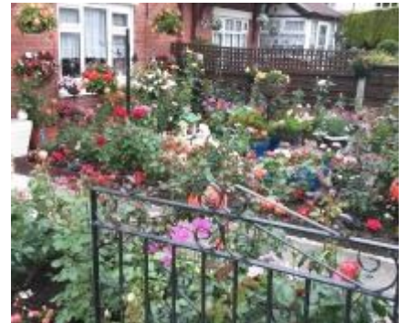
Highly Commended Kingsley Street