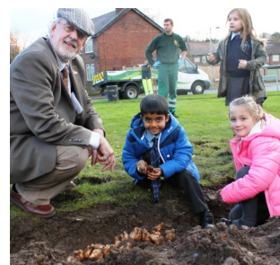
Bulb planting—Mayor looks on