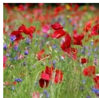
Wildflower Meadow looks best in August