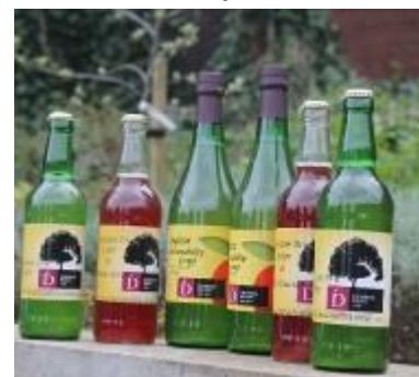
Congleton Apple Juice and Congleton Cider