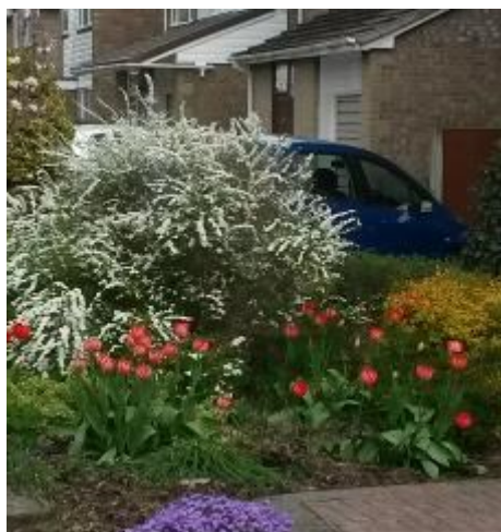
Spring entry—Favourite Front Gardens