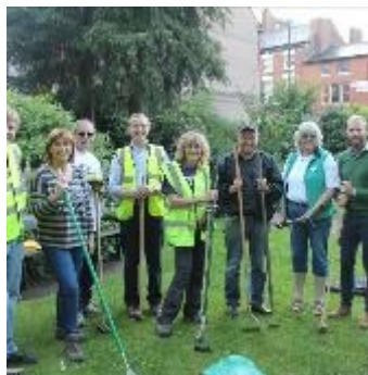
Back breaking removal of weeds—heritage path