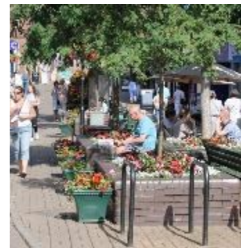
Greening the Town Centre for shoppers