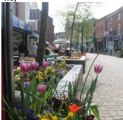
Spring Bedding —Town Centre