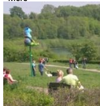
At Astbury Mere