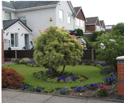
Highly Commended Longsdale