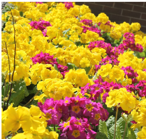
Spring Bedding Plants—Town Centre