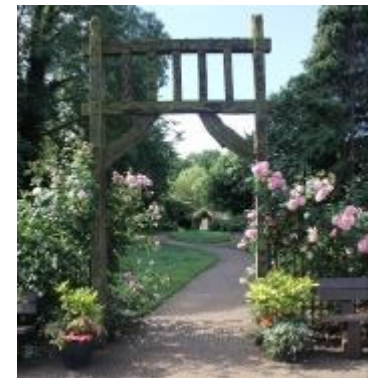
Community Gardens— now est. 20 years

Congleton and District Horticultural Society —49 years old! Record entries at Annual Show in the Town Hall in September 2014—140 categories. Under 16s enter free