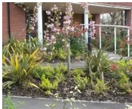
McCarthy Stone Retirement home