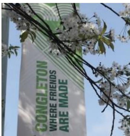
Blossom and Flags—Mountbatten Way