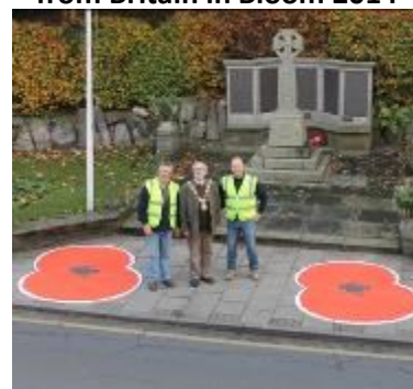
Pavement Poppies at Cenotaph