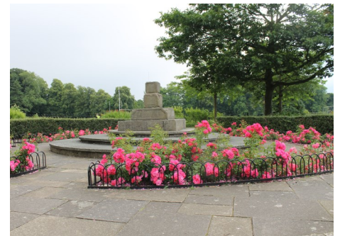
St Peters Church