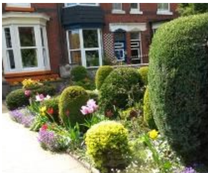
Highly Commended Park Road