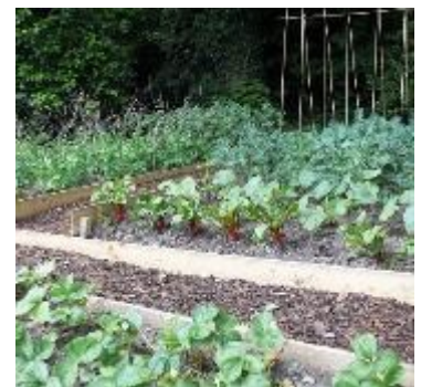
New Community Allotment in the Park