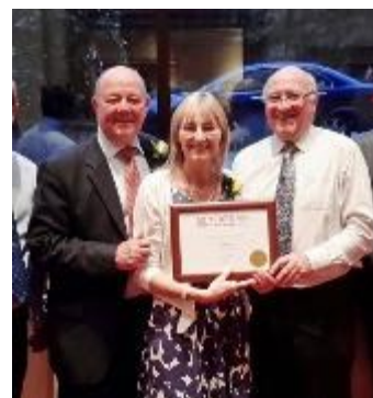
Collecting Gold Medal from Britain in Bloom 2014

January & February: Held In Bloom thank you and support for 2015 event at the Town Hall. Finalised Town Centre spring planting scheme and order plants. Gardeners changed some of the planting shapes in the park (10 year Heritage commitment finished). Added height to plant beds. Campaign to reduce dog fouling launched. Winter maintenance programme includes pruning trees, hedges and shrubs. Member of In Bloom team invited by Britain in Bloom to share experiences at SW in Bloom regional training sessions.