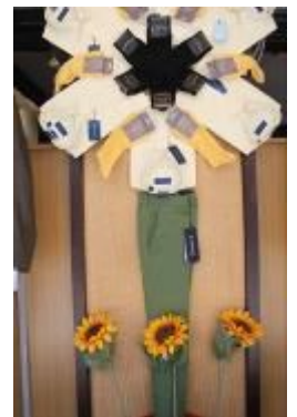
Davenports Window Display