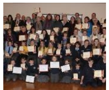
So many people to thank for their help and support