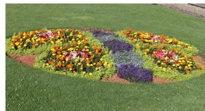
Butterfly in the Park