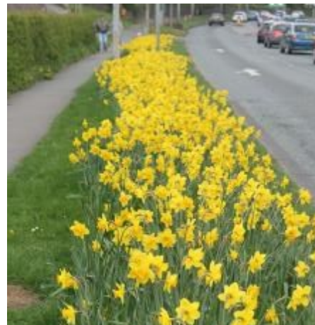
New Daffodils—Clayton Bypass