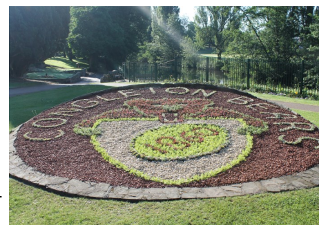
Formal Plaque in celebration of the World Cup Rugby 2015