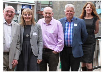
Sharing information with SW in Bloom