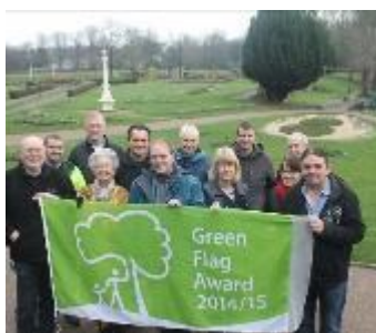
Another Green Flag for the Park