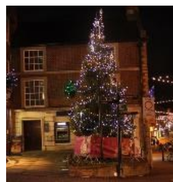
Recycled over 120 Christmas Trees