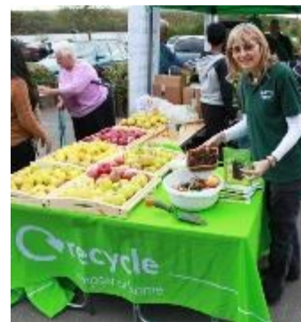
Seed Swaps—Astbury Mere Oct 14 and May 2015