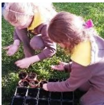
Planting up WHERE WHAT WHEN?