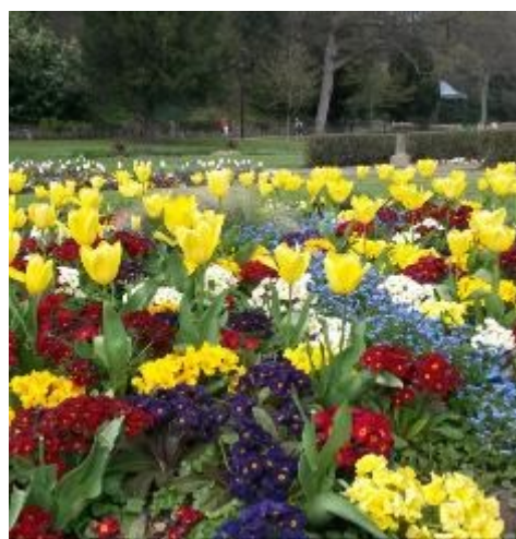
Spring Congleton Park