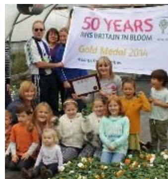
Celebrating GOLD at Britain in Bloom