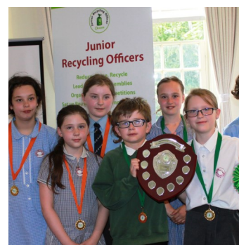
Junior Recycling Officers – winners!