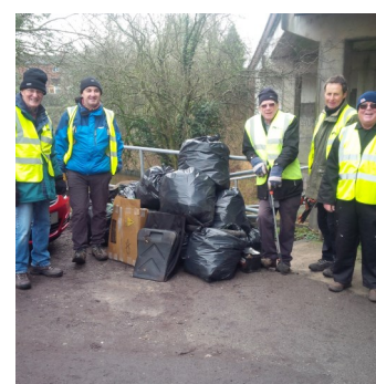
Railway and Canal Working Parties collecting litter