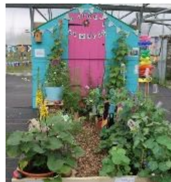
Back2Back school gardens in Polytunnel

In Autumn 2012 Lime Trees were planted on the A34 and in the Park. This is planning ahead so that the trees can be established before older deceased trees needs to come down.