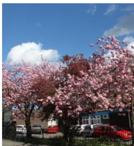
Spring Blossom - St Mary's School