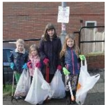
Cleaning up our neighbourhoods