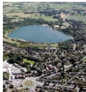
Ariel Shot of Astbury Mere

Wildflower Meadows - Congleton Rotary has sponsored a wildflower meadow in the park at the site of the annual Rotary Bonfire for 4 years. There are also wildflower meadows at the Mere, and at many of the schools.