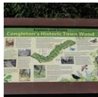
Town Wood Interpretation Signs