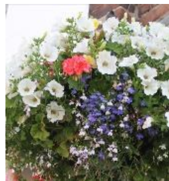
240 Hanging Baskets sponsored by companies