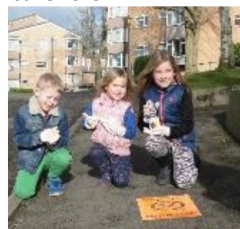
No Dog Fouling signs added to pavement